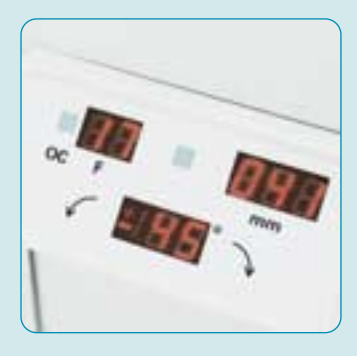
With its automatic compression optimization that adapts to individual breast characteristics and DoseWise dose control, MammoDiagnost is a system that takes patient safety and comfort to a whole new level.